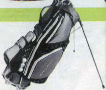
BMW Golfsport OGIO golf bag $375. Stockists: 1800 813 299.