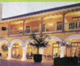
Gifts That Thrill "Revive Spa Country" package at Peppers Springs Retreat, Hepburn Springs, including a 45 minute relaxation massage and a two-course luncheon with wine or beer, $153 per person. Details: www.giftsthatthrill.com.au