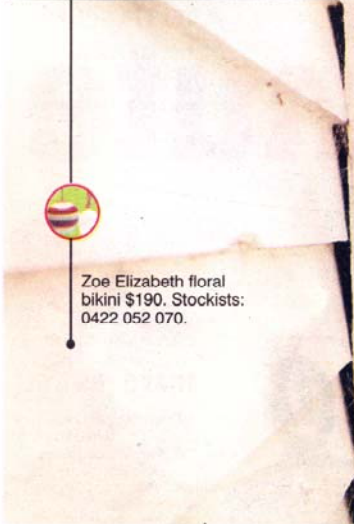
Zoe Elizabeth floral bikini $190. Stockists: 0422 052 070.

Spoil the one you love, or yourself, with these great ideas for guys and gals