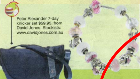
Peter Alexander 7-day knicker set $59.95, from David Jones. Stockists: www.davidjones.com.au