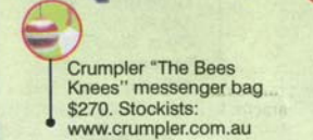
Crumpler "The Bees Knees" messenger bag $270. Stockists: www.crumpler.com.au