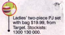
Ladies' two-piece PJ set with bag $19.99, from Target. Stockists: 1300 130 000.