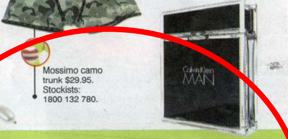
Mossimo camo trunk $29.95. Stockists: 1800 132 780.