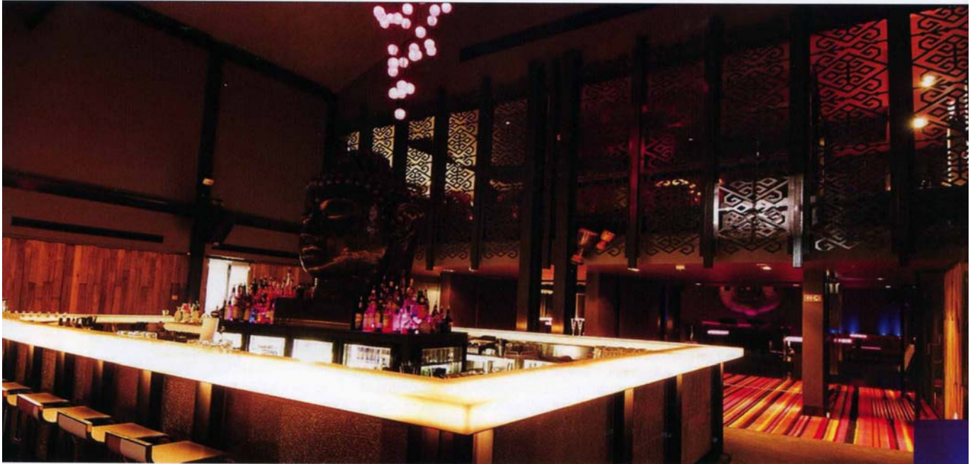
All pictures courtesy of Alumbra.